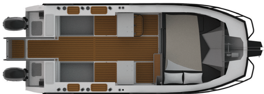
PLAN VIEW OF CABIN