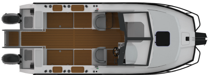
PLAN VIEW OF COCKPIT